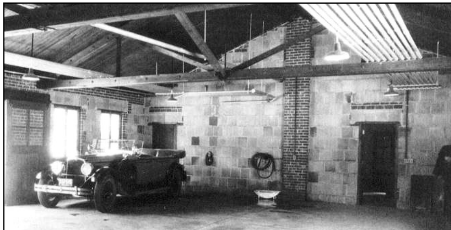
Community Building Garage, 1927 Sanborn Photo

A brick paved, covered porch ran across the front and around the east side where visitors could relax and enjoy the view of Cascade Mountain. Tennis courts and a park complete with underground sprinkling system adjoined the building.