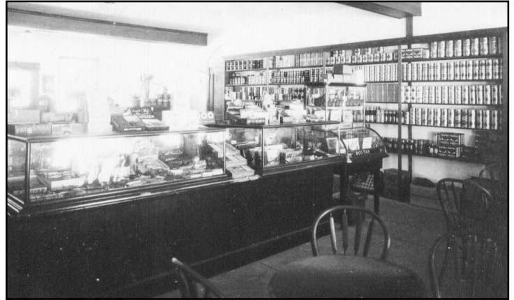
Cascade Community Building Tea Room and Grocery Store, 1920 Sanborn Photo