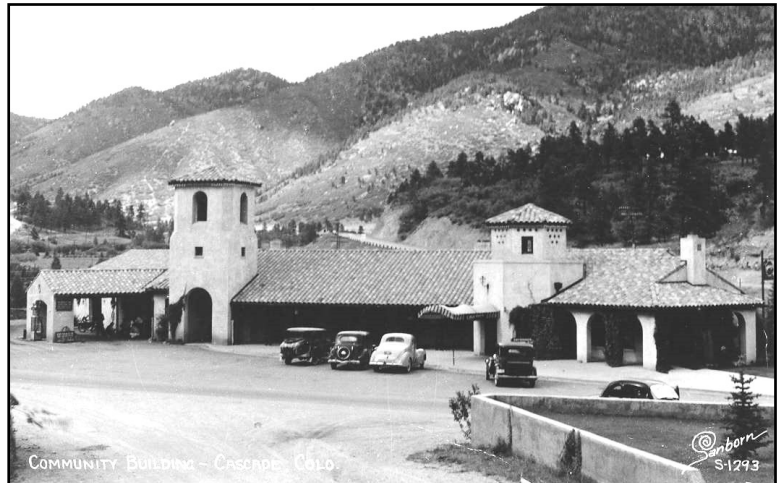
Community Building, Cascade, Colorado Sanborn Postcard